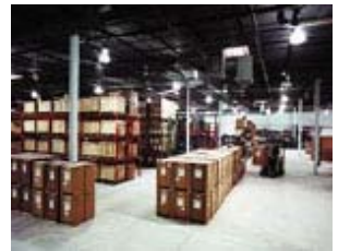
Yamada America Warehouse

The Yamada Headquarters is located in Tokyo , with primary manufacturing based in Sagamihara City, Japan . Assembly facilities are located in the Netherlands and West Chicago, IL . With over 150 distributors worldwide, Yamada is in position to service the global markets needs.